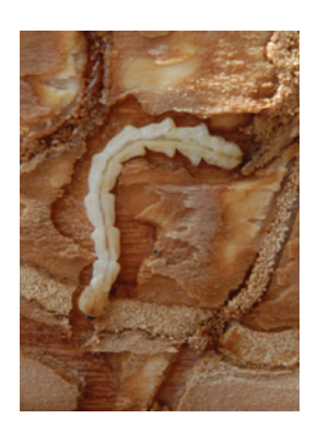
EAB larvae damage the vascular system of the tree as they feed, which interferes with movement of systemic insecticides in the tree.

greater than 15 inches at a rate that is twice as high (2× rate) as the rate used for smaller trees (1× rate). In an OSU study in Toledo conducted from 2006–2014, imidacloprid soil drenches effectively protected ash trees ranging from 15–22 inches in diameter when applied at the 1× rate in spring, or at the 2× rate when applied in either the spring or fall. These treatments were effective even during years of peak pest pressure when all of the untreated trees died. Trees treated in fall with the 1× rate, however, declined and had to be removed.